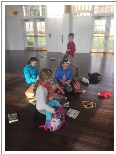
Sunday School kids fill backpacks for foster children

So many heartfelt thanks go out to the many local businesses, organizations and caring individuals who contributed to the Fostering Love program. Over 60 duffle bags and backpacks were delivered to CASA SHaW and will be further distributed to children in foster care. We expect to deliver another 20-30 in the next two weeks. Special thanks goes to the following businesses and organizations for their generous contributions: